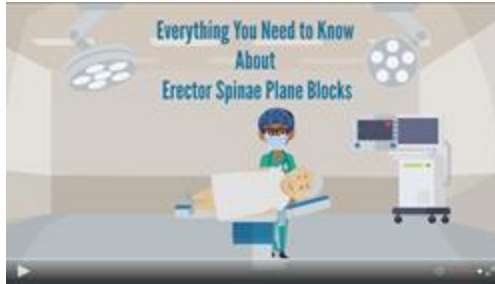
DNP Project Video